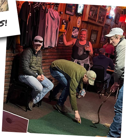
JUST UP TO NO GOOD!