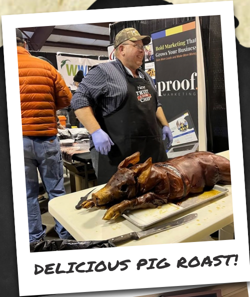
DELICIOUS PIG ROAST!