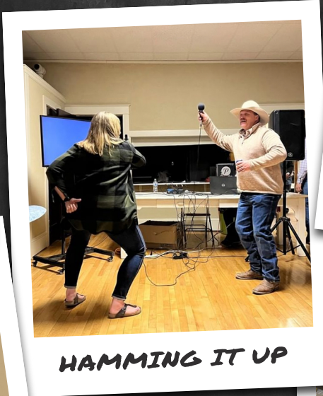
HAMMING IT UP