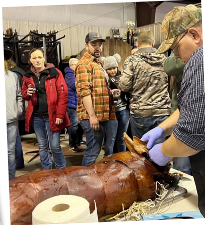
HAMMING IT UP