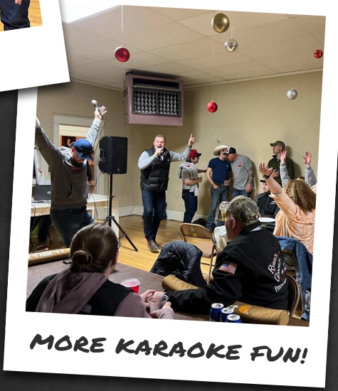
MORE KARAOKE FUN!