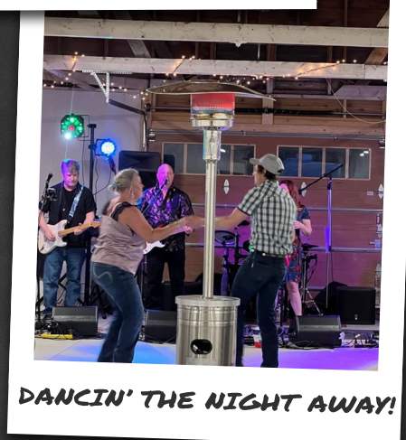
DANCIN' THE NIGHT AWAY!