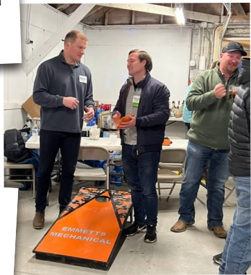
FUN + GAMES!