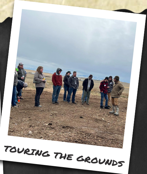
TOURING THE GROUNDS