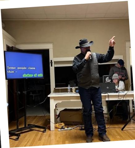
MORE KARAOKE FUN!